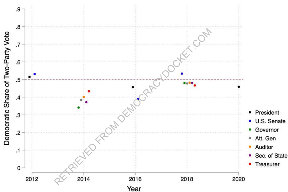
Figure 1: Statewide General Election Outcomes, Ohio, 2012-2020